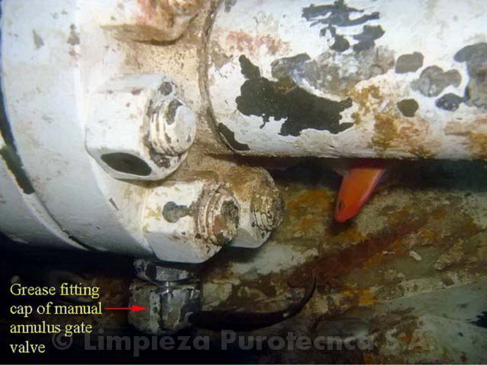
Grease fitting cap of manual annulus gate valve